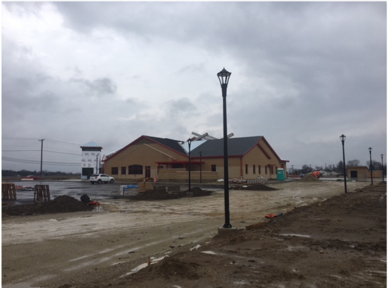
New light poles at the fire house.