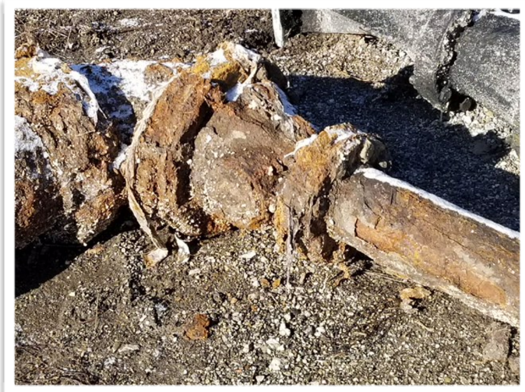
New and old pipes at the wet well at the WWTP.